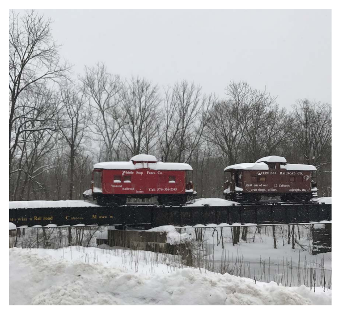
Happy Holidays from the KeyHIE Team! Best Wishes for 2018! See you at the User Group Conference in March.